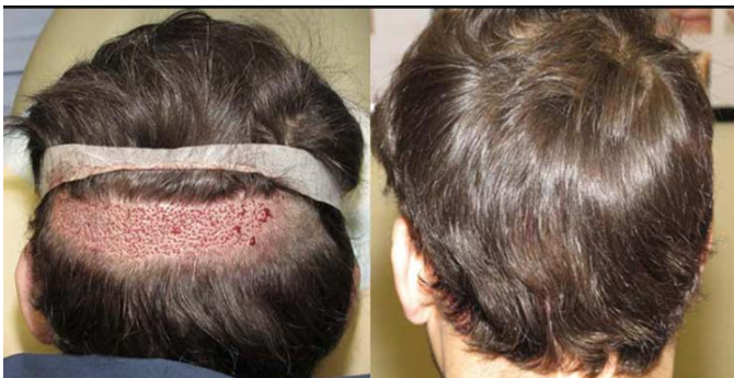
Tape Up Method Example 1

Grafts 1300+: We MUST shave the entire back of your head to the skin like you see in photo # 3