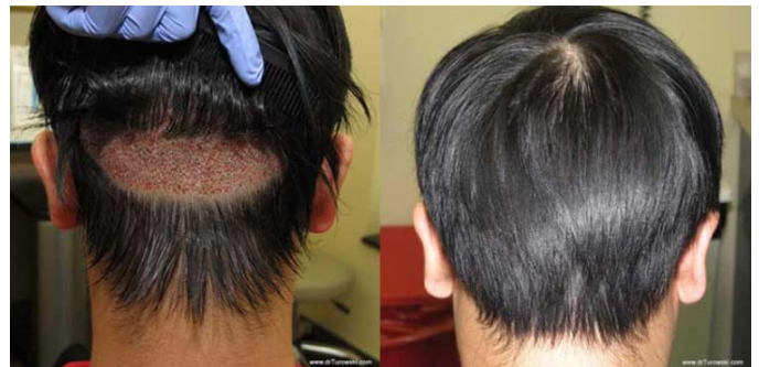
Tape Up Method Example 2