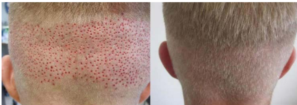
Shaved Head Day 1 vs Day 7